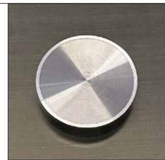
Solid top glass surface without holes